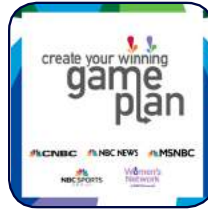
Create Your Winning Gameplan Best Diversity and Inclusion Initiative CNBC