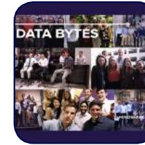
Mindshare's Data Bytes Program Talent Recruiting Initiative Mindshare