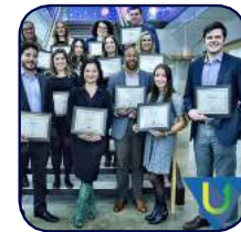
UpStartU Best Training & Development Initiative Horizon Media Inc.